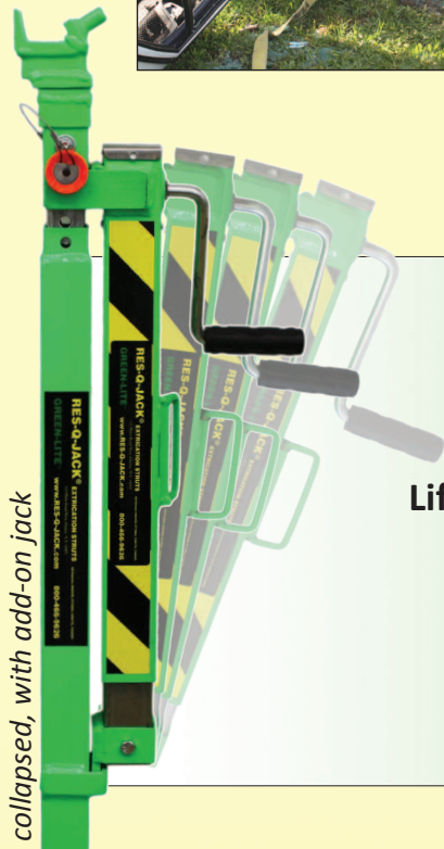
collapsed, with add-on jack