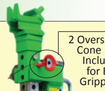
2 Oversized Cone Pins Included for Easy Gripping.