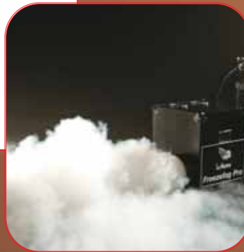
Freezefog Pro in action