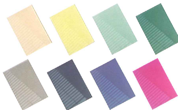
Examples of varnished glass

Product protected by patent rights across the entire European Union area, issued by the Patent Office of the Republic of Poland.