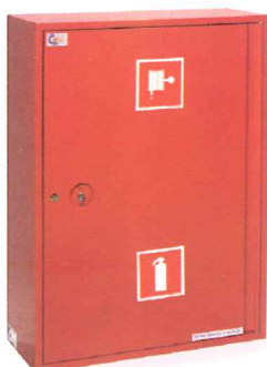
KP model (kombi horizontal)