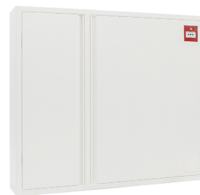
C32-N cabinet with manual fire alarm (optional)