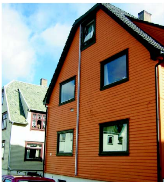
The ladder mounted on a family house