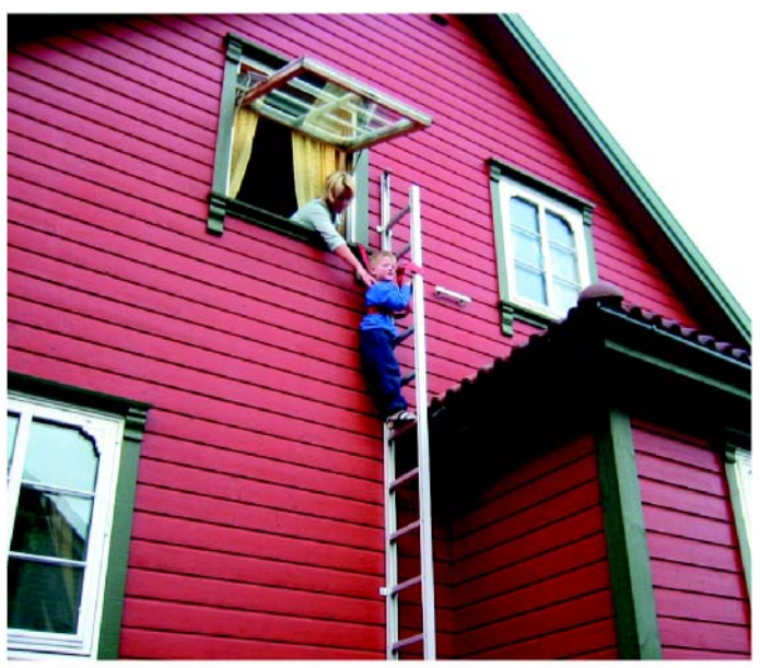
The Escape ladder can be supplied with a safety harness.

In houses with more than one floor the sleeping rooms are generally on the first floor, and since fires often break out on the ground floor it could be impossible to make an escape via the stairs. In these cases a MODUM escape ladder will ensure a safe escape.