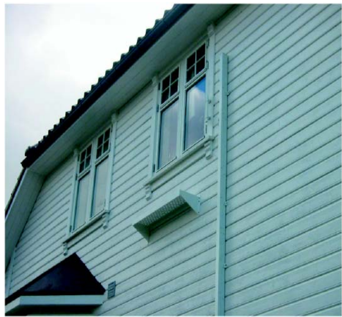
If the window opens "the wrong way" the escape ladder can be supplemented with an outdoor step.

The ladder is produced from anodized aluminium and stainless steel, and therefore it is extremely durable in all kinds of weather. It is Tüv approved to a weight of 500 kilos per meter. The ladder is extremely stable. It can be mounted by anyone with minimum skill.