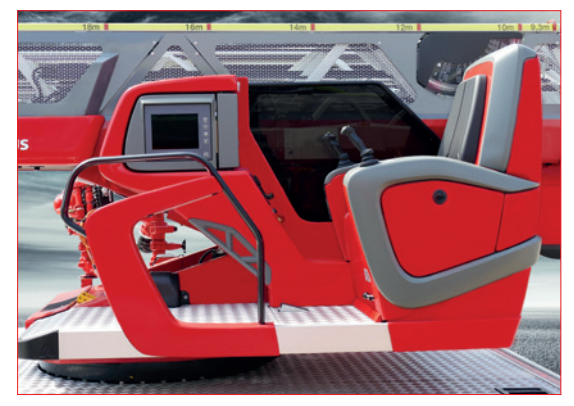
Ergonomic main control stand