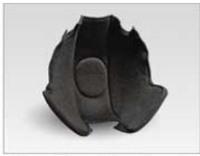
Lining with comfort soft pad (detachable and replaceable)

COMPOSITE LONG FIBRE SHELL permanent performances over the time