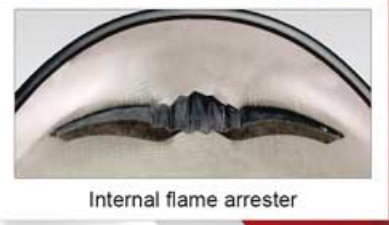
Internal flame arrester