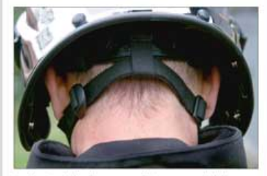
Adjustable fire proof trapezoidal chinstrap/neck-strap with leather chin-cup