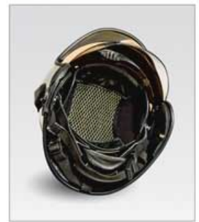
Adjustable antistatic net cradle

External Knob for size adjustment system (patented). No interference with neck protector. Easy to use even when wearing fire-fighting gloves. The required setting can be changed depending on the operation (tight for extreme situation, looser in less dangerous conditions)