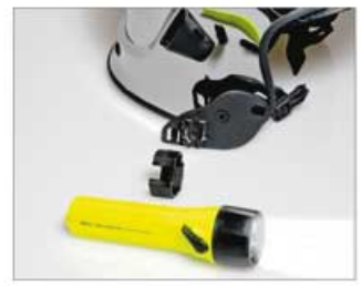
Torch holder support (detachable)