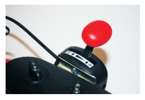
IDLE RUN position (turtle)