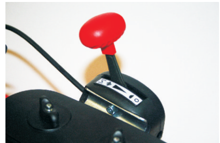
OPERATION position (hare)