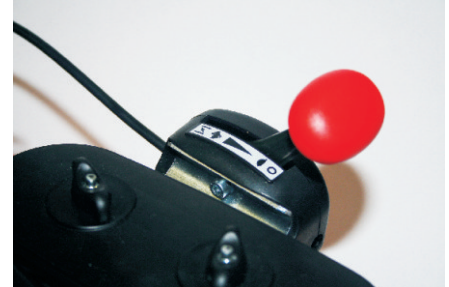
STOP position (zero)