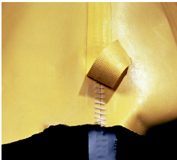
TRELLCHEM EVO/VPS SEAM

With the Trellechm® Bayonet glove ring system it is quick and easy to exchange both inner barrier gloves and outer rubber gloves.