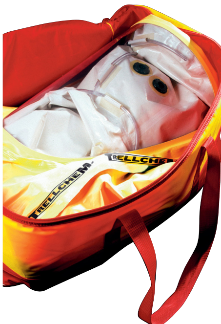
Trellechem® storage bag

Attached to the inside of the visor, the antifog lens prevents the visor from becoming foggy. Additionally a tear-off lens can be attached to the outside of the visor to prevent scratches and splashes from aggressive chemical substances. Just tear off for a clean and unobstructed visor!