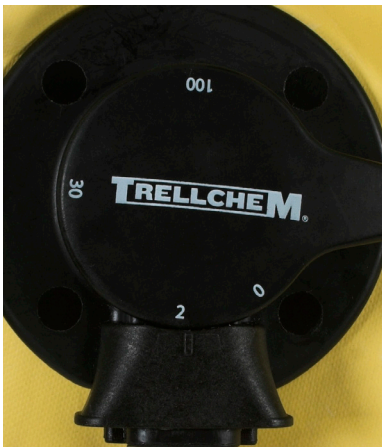
Trellechm® Mk II regulating valve for suit ventilation