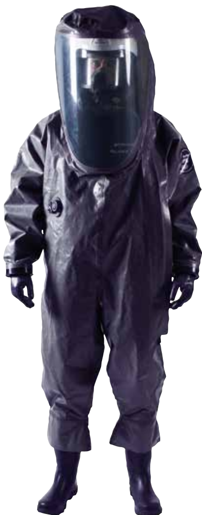
Trellchem ® VPS type VP1 (black) with sewn-in socks/booties and separate boots.

Provides maximum protection against hazardous chemicals in liquid, vapor, gaseous and solid form, including warfare agents. Trellchem ® VPS is certified to the European standards EN 943-1 and EN 943-2/ET.