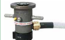
Style 887 Self-Educating Nozzle (500 GPM)