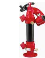
Style 656 shown with Style 622 monitor liftoff