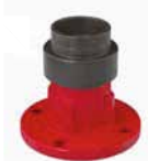
Style 190 Direct Mount Flange