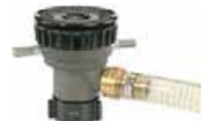
Style 888 Self-Educating Nozzle (750 GPM)

sales @protekfire.com.tw • www.protekfire.com.tw